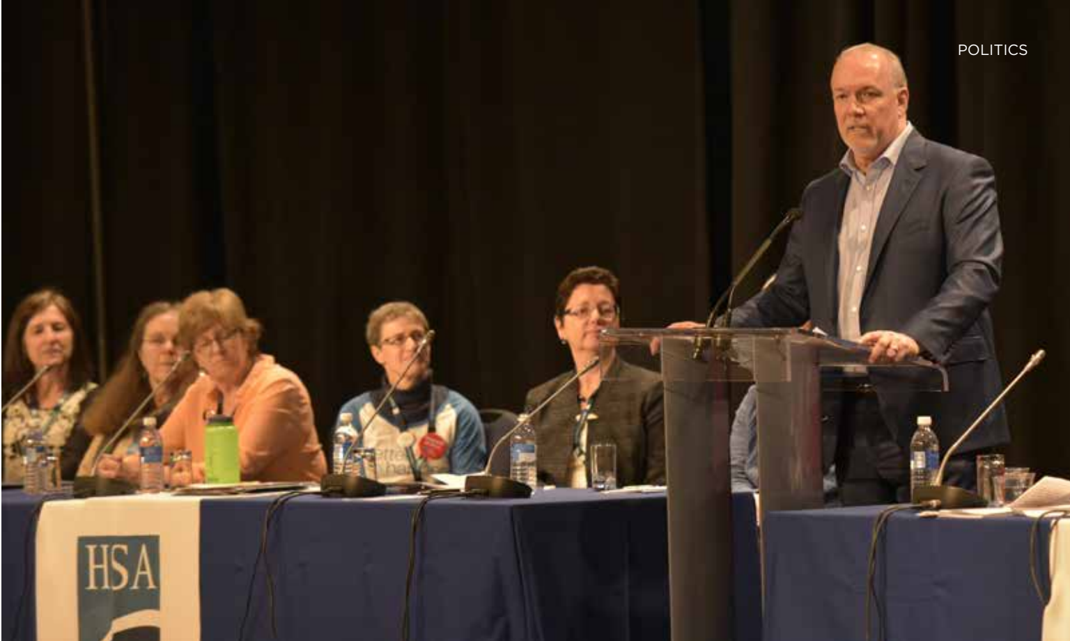
NDP LEADER JOHN HORGAN SPOKE TO DELEGATES AT HSA'S APRIL CONVENTION