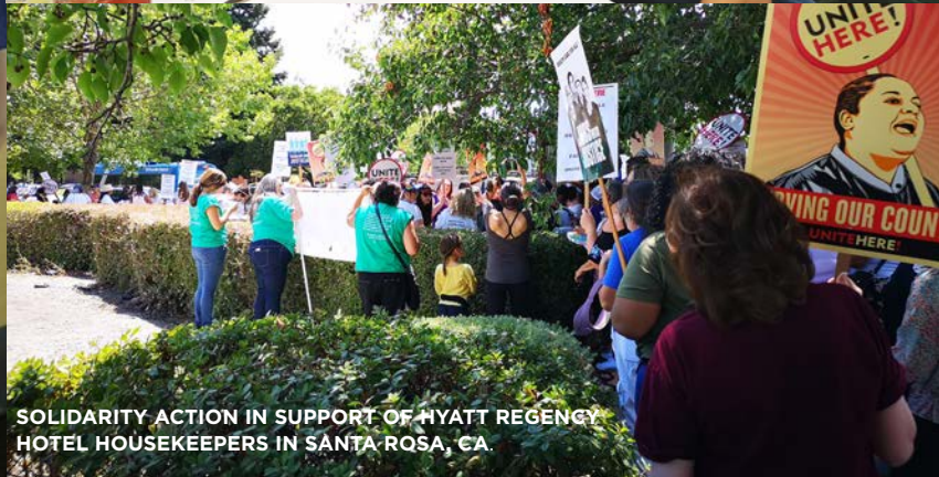
SOLIDARITY ACTION IN SUPPORT OF HYATT REGENCY HOTEL HOUSEKEEPERS IN SANTA ROSA, CA.