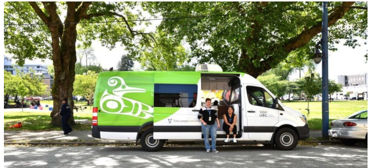
VANCOUVER COASTAL HEALTH'S NEW MOBILE HEALTH VAN, SERVICING THE DOWNTOWN EASTSIDE.

Of course we see health disparities. It is a really wide gap in all areas of health. We are a small percentage of the community and yet we are overrepresented with chronic health issues, acute health issues, and especially mental health issues. And it all originates from the impacts of colonization and the historical trauma that ensued from that, which we all carry today.