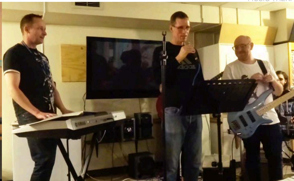
THE BCMHA BAND.

when clients enter the studio and engage with the recording software, they may walk away with a new skill.