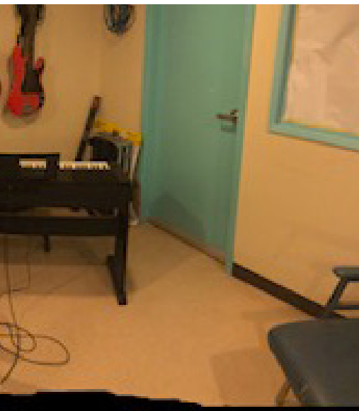
HEALTH AND ADDICTIONS (BCMHA) MUSIC STUDIO.