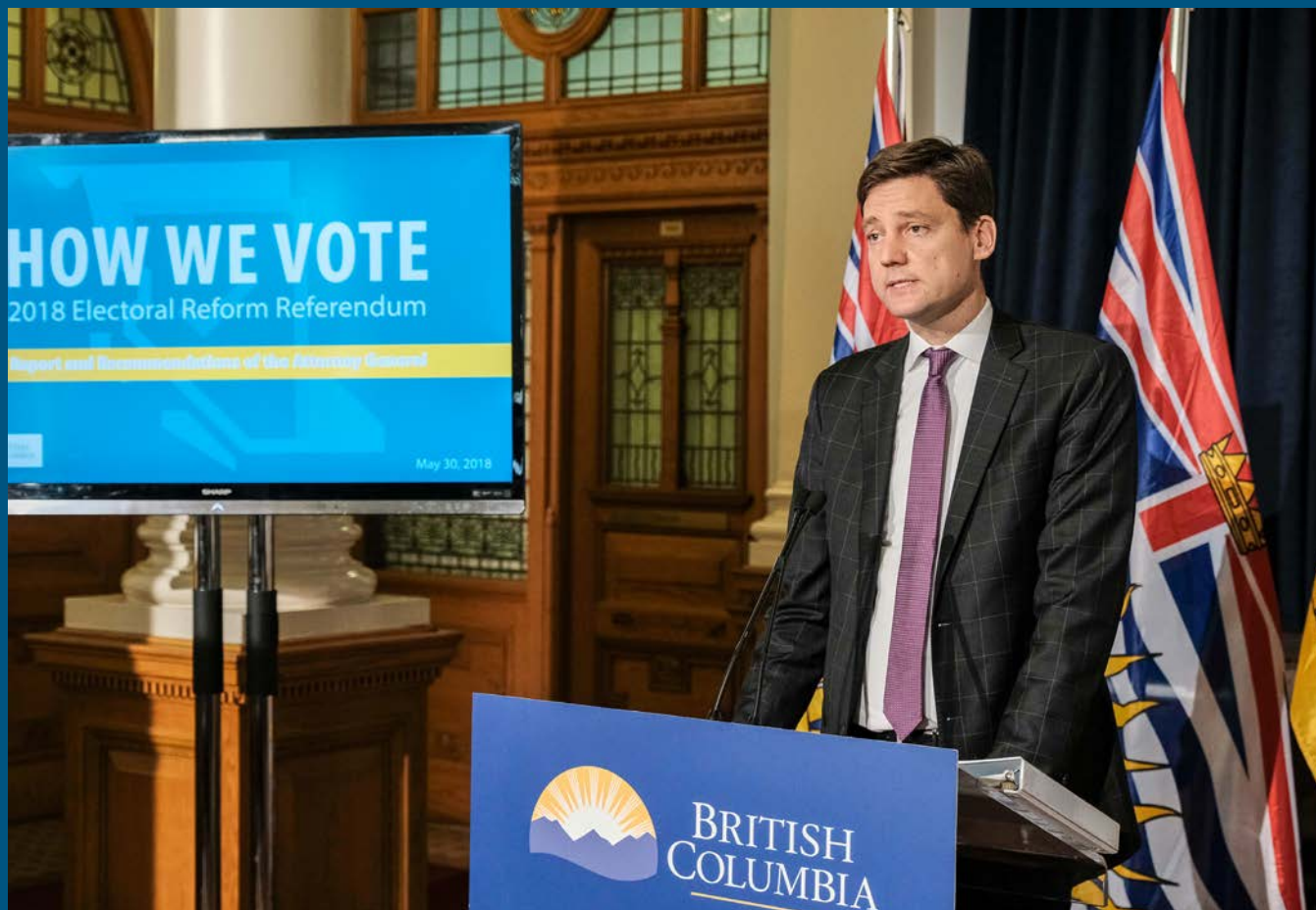
B.C. ATTORNEY GENERAL DAVID EBY.