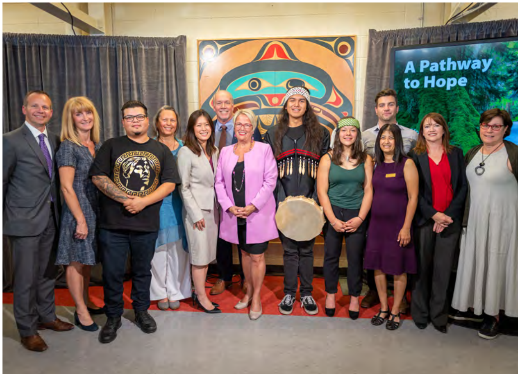
JUNE 26, 2019: THE BC GOVERNMENT LAUNCHES A PATHWAY TO HOPE.