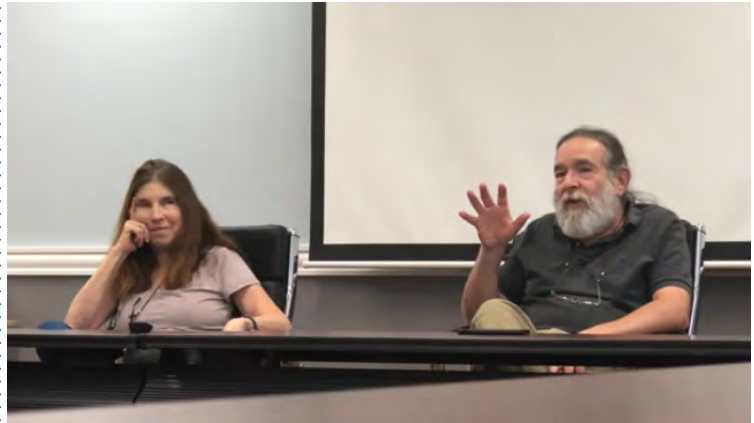
DR. STEFFIE WOOLHANDLER AND DR. DAVID HIMMELSTEIN, CO-FOUNDERS OF THE US-BASED ORGANIZATION PHYSICIANS FOR A NATIONAL HEALTH PROGRAM, SPEAK AT A PUBLIC TALK ORGANIZED BY THE BC HEALTH COALITION.

US spends about $6,500 per person in government money on health care, and that is more than any nation, except Switzerland, spends on their entire health care system.”