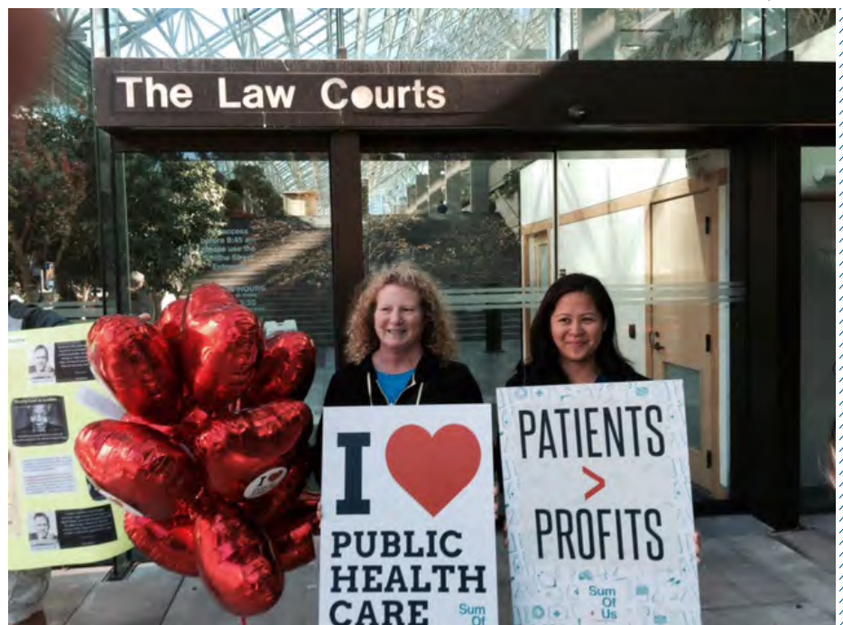
HSA MEMBERS OUTSIDE THE BC SUPREME COURT IN SETEMBER, 2016.

Himmelstein points to how the US system, which has a booming private health sector, ranks second in the world in terms of total government expenditures spent per capita on health care. According to Himmelstein, "The