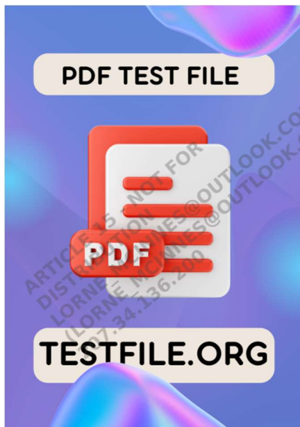
Example of PDF with watermark

Note: to change your password click on your name in the top right and select Options.