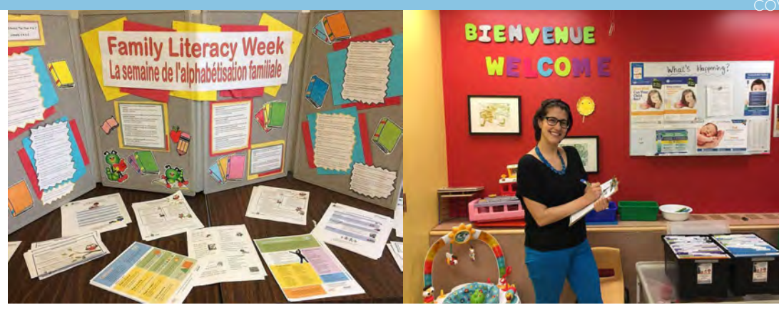
PHOTOS OF COMMUNITY PROGRAMMING OFFERED BY THE CENTRETOWN COMMUNITY HEALTH CENTRE