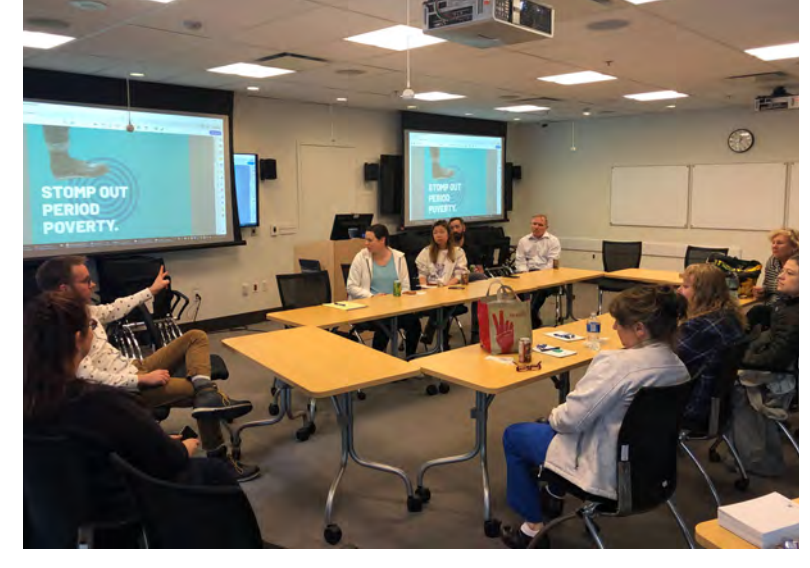
PERIOD POVERTY CAMPAIGN LAUNCH AT ROYAL JUBILEE HOSPITAL, FEB. 13, 2019.

Rongve kept track of donation sites through a sign-up sheet, and at the end of the campaign, the sites submitted their product tabulations. In two weeks, the chapter collected just under 10,000 products, which were delivered to the United Way's