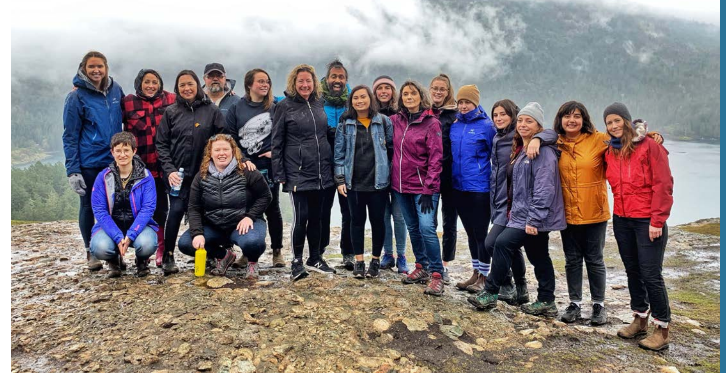
STAFF FROM THE VICTORIA BRANCH OF THE CANADIAN MENTAL HEALTH ASSOCIATION - BC DIVISION.