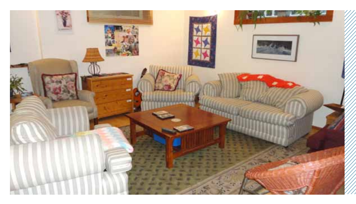
ONE OF THE COMFORTABLE ROOMS DESIGNED TO WELCOME WOMEN AND THEIR CHILDREN TO SALT SPRING TRANSITION HOUSE.