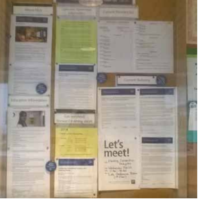
A PROVINCE-WIDE BATTLE FOR THE MOST-IMPROVED-BULLETIN-BOARD ERUPTED ON FACEBOOK THIS SPRING.

Members are busy. They are bombarded with email and social media. Sometimes, the best way to tell them about HSA is through the worksite bulletin boards. But what impression do your boards make?