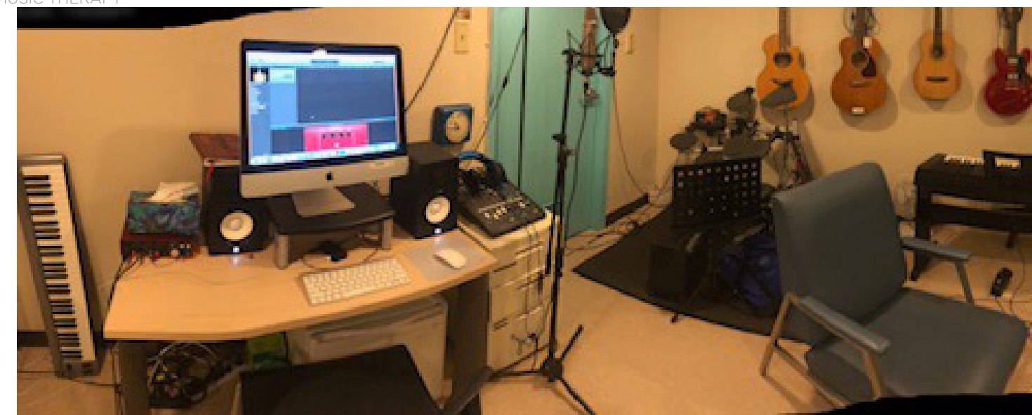
THE BURNABY CENTRE FOR MENTAL