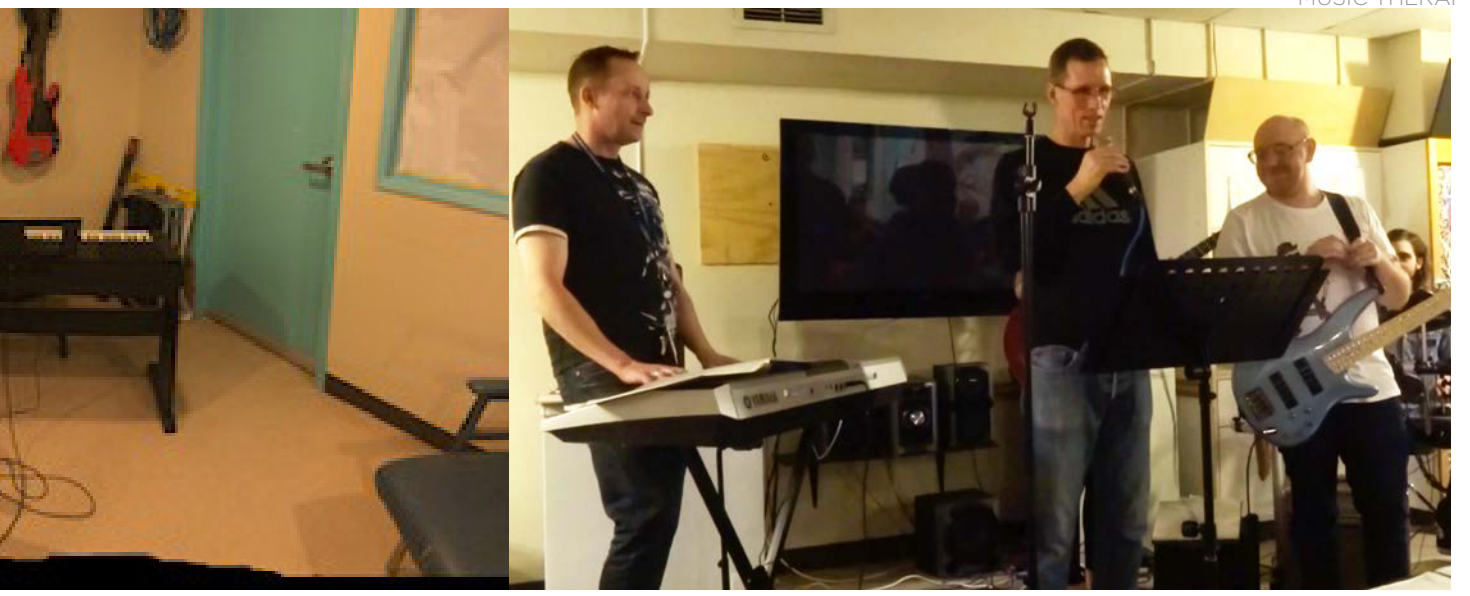
HEALTH AND ADDICTIONS (BCMHA) MUSIC STUDIO.